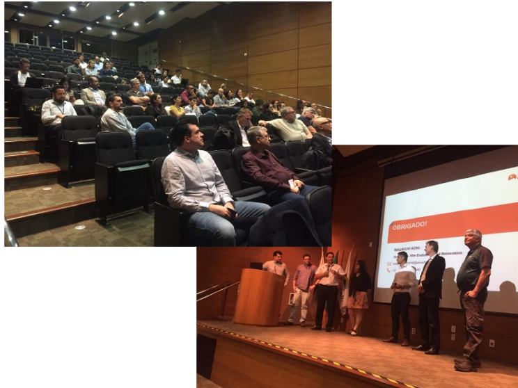
Participation and Support on the Symposium on Contamination in Fractured Bedrock Rio de Janeiro, RJ – June 2019