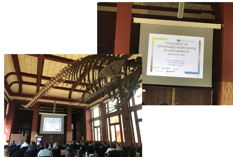
Presentation at the AquaConSoil Antwerp, Belgium – May 2019